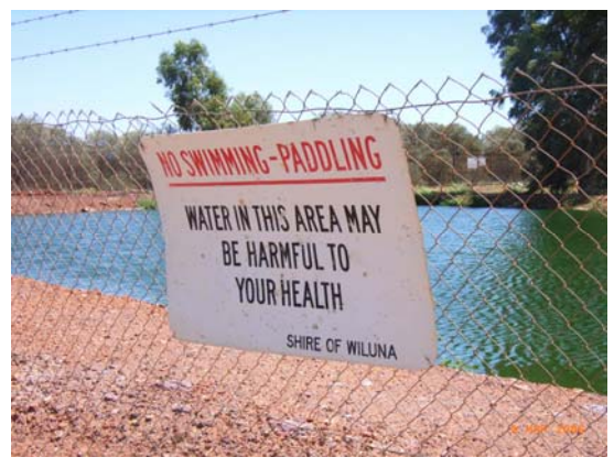
Figure 4: Overflow area top photo, sewerage treatment ponds (photos from Bill Atyeo, Environmental Health Officer, Wiluna).