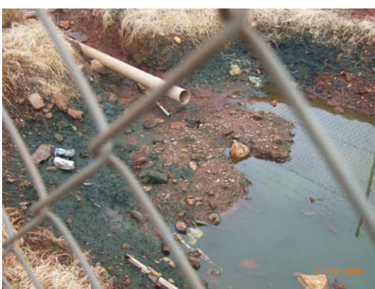
Figure 2: Inlet pipes and beer can from overflow sewerage treatment ponds (photo from Bill Atyeo, Environmental Health Officer, Wiluna).