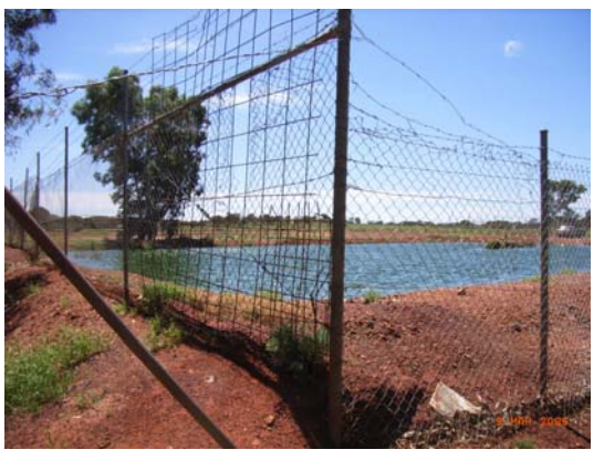
Figure 5: Fence Breeches sewerage treatment ponds (photos from Bill Atyeo, Environmental Health Officer, Wiluna).