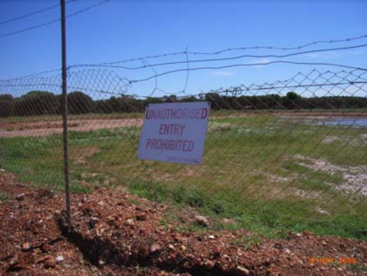
Figure 3: Present day sewerage ponds (photos from Bill Atyeo, Environmental Health Officer, Wiluna).

There is proposed further development of: