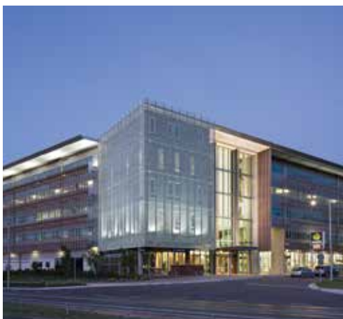
The new Clinical Practice Building which houses JCU health services, a supermarket, coffee shop and pharmacy is in a convenient on-campus location.