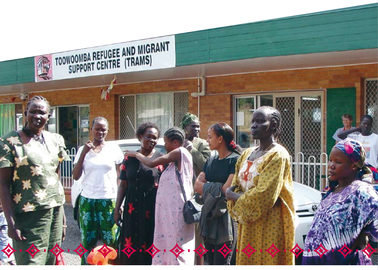
PLATE 3.4 FOCUS GROUP 3 - TRAMS

"If there is a fire in your house your biggest concern is the life of your kids"