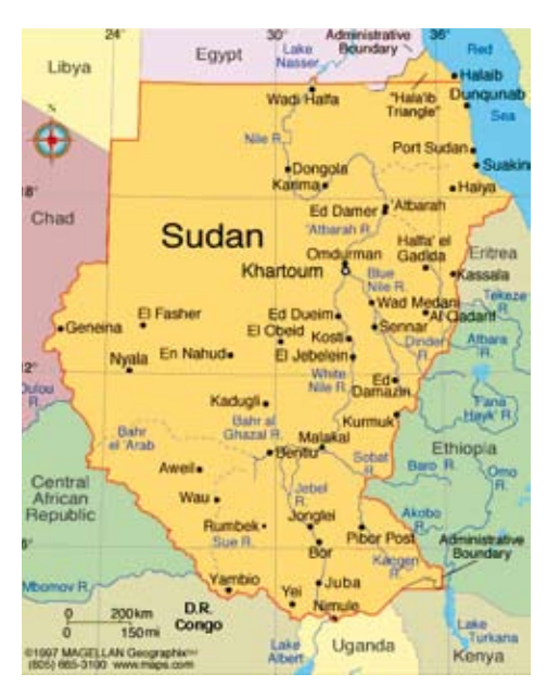
Figure 2.1 The Country of Sudan

Fire is imperative to the Sudanese subsistence. A large proportion of households in Sudan, particularly those from the south rely on fire for their daily cooking needs. In most households, cooking is undertaken outside the home on open fires using fuels such as coal or wood. Given the rural predominance in the south, most people practice shifting cultivation¹ or are pastoralists. In this practice, fire is used to clear the land and provide ash as a 'fertiliser' for the soil.