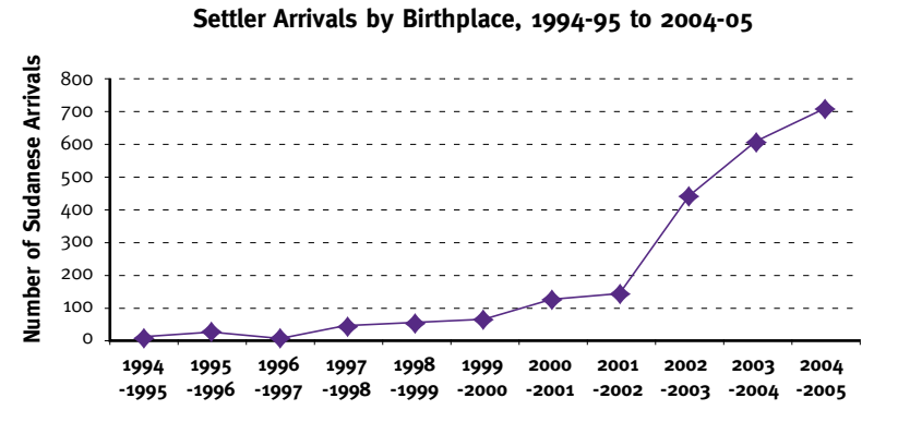
Figure 2.4 DIMIA, 2005

The number of Sudanese who have settled in Queensland from 1994-1995 to 2004-2005 is illustrated in Figure 4.