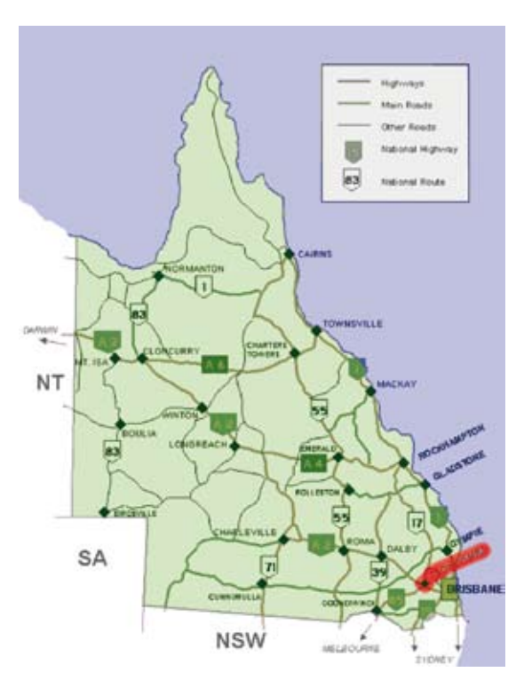
Figure 3.1 City of Toowoomba (Wikipedia, 2006)

The city of Toowoomba is located 132km west of Queensland's capital city, Brisbane, and two hours drive from the Gold Coast and Sunshine Coast beaches (Figure 3.1). In 2003, the city's population was estimated at 113,687 making Toowoomba Australia's second largest inland city after Canberra, the nation's capital (Wikipedia, 2006). Given the large concentration of Sudanese located in Toowoomba, the city became the ideal site for QFRS to conduct this research.