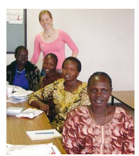
PLATE 3.2 FOCUS GROUP 1 - TAFE

This research project is not without limitations. The participants of this research varied in both number and diversity. Given the number of participants was fairly small and consisted of a larger proportion of females, the views expressed by participants cannot be assumed to represent those of the broader community. The responses given however are considered to have some validity given they belong to members of the Sudanese community.