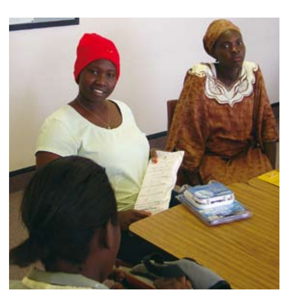
PLATE 3.1 FOCUS GROUP 1 - TAFE

Some participants had experienced bushfires in their homeland. People used a traditional method to extinguish the fire which involved beating the fire with sticks and leaves. The focus group findings indicate that in terms of fire in Africa, the focus is on response rather than prevention.