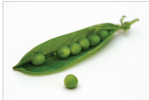
High resolution photo