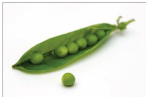
High resolution photo