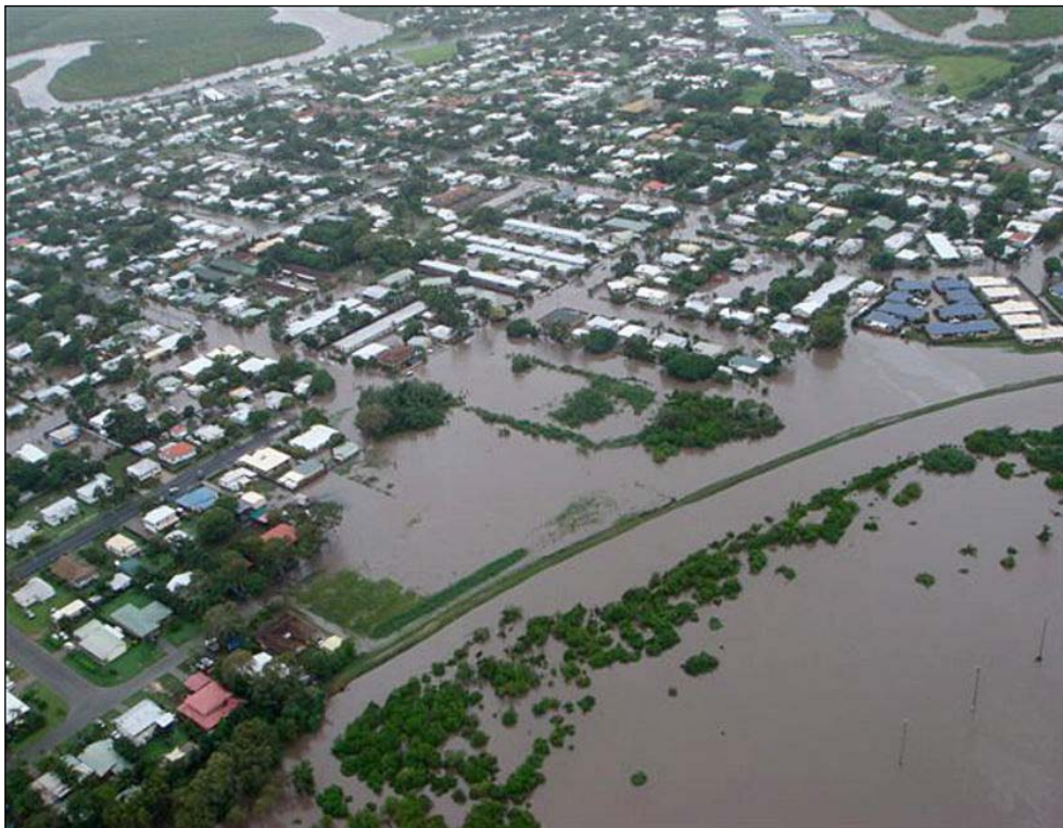
Floods and climate change impact Scenarios: Part of the Gooseponds and Barnes Creek Road, North Mackay, 15 th February 2008

The Pioneer River runs out to sea through the city of Mackay. Relatively small in area, with steep slopes in parts of the upper reaches, the catchment of the Pioneer poses a flood threat to the town. Major flood levels have been reached 20 times since 1884. The rainfall event on 15 th February 2008 was extremely intense and rare (100 year average recurrence interval). Around 4000 homes were flooded.