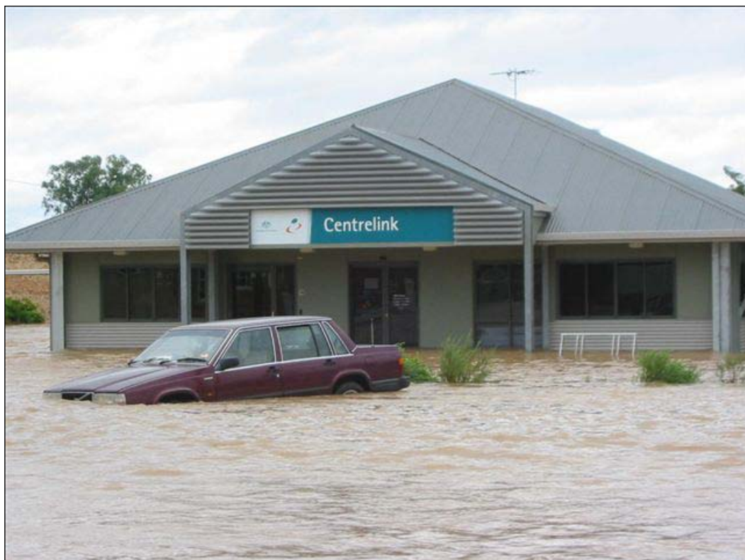
Infrastructural and Built Environment Vulnerability: Institutions flooded in Charleville floods, 2008

are already occurring such as cooperative emergency management planning and whether regulation may be needed to encourage better long-term planning for the impacts of climate change, where the market operates on short-term gains (for example, development is continuing in high risk locations such as low lying coastal and bushfire prone areas because land and property sales provide revenue for local governments) and mechanisms by which to ensure that new property developments and infrastructure are constructed in a risk appropriate manner consistent with local hazards. This project focuses on the use of building codes, land-use planning and housing insurance as key regulatory mechanisms in climate change adaptation. The first stage of the research has been the identification of a stakeholder reference group in the areas of planning, building standards, housing and insurance. This group can contribute knowledge of the industry and regulatory framework and advise the research group of the viability of solutions and strategies. The background to the research has started with a summary document of existing literature in the areas of planning, building codes and housing. This literature review has been circulated amongst all of the research group and the stakeholders. Case study locations and areas have been identified for the next stage of the research, where data will be collected.