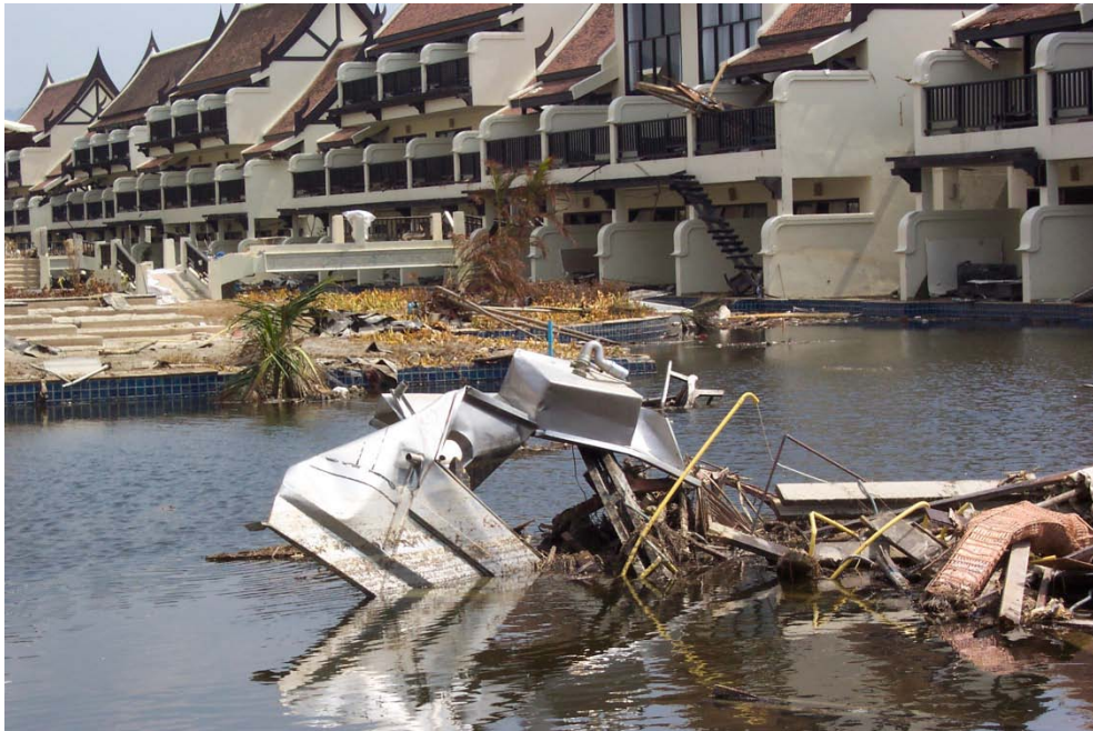
Tourist Destination Vulnerability: Hotel at Kao Lak, Thailand destroyed by the 2004 Tsunami, already back in business.

Through research, documentation, and analysis of the recent experiences of crisis in the internationally renowned tourist destinations of Bali and Phuket, the study has produced a comprehensive series of practical (“all-hazard”) strategies for developing a more holistic, integrated approach to effective destination crisis management - implemented at the local community level. This study is near completion.