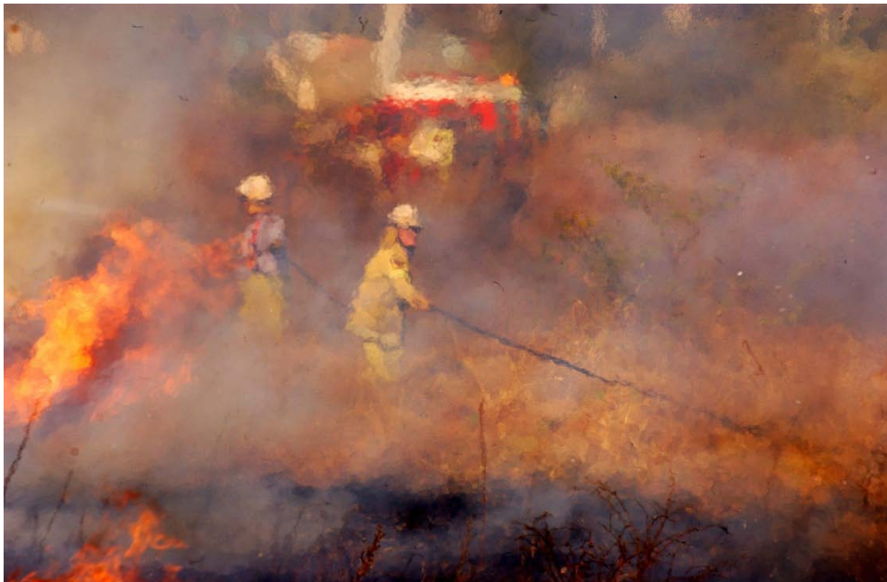
Bushfire Risk and Communities: Fighting bush and grass fires in rural Thuringowa

Nevertheless, presentations still occur, with contributions to QFRS at The 2010 Volunteers Summit and training sessions for Community Education Officers.