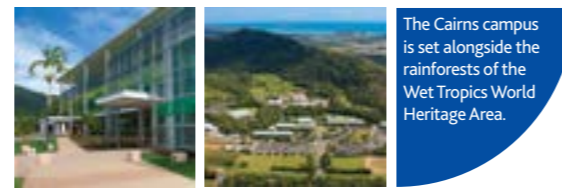
The Cairns campus is set alongside the rainforests of the Wet Tropics World Heritage Area.

SOCIAL LIFE @ JCU Proudly brought to you by YOUR JCU Student Association!