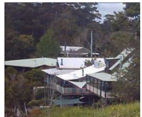
▶ RIGHT: A TYPICAL HOUSE AT TAMBORINE MOUNTAIN.