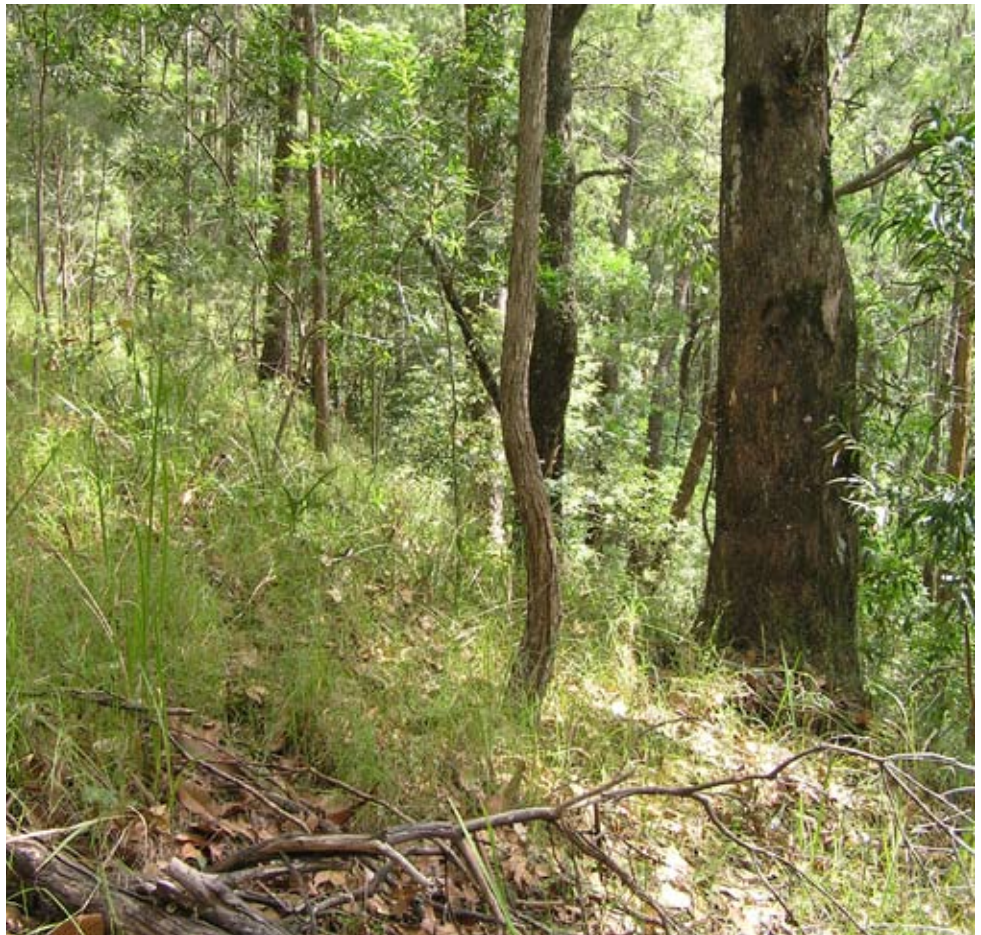
▲ ABOVE: WONGAWALLAN ROAD, EAGLE HEIGHTS, TAMBORINE MOUNTAIN.

Community groups seek optimum controlled burn return intervals, and some justification of how and when controlled burns are done. Household holders were not confident about the costs of protecting property against fire and what to do for bushfire safety if needed. A wide range of media was found to be the preferred way of receiving information. Direct contact with fire services was not preferred. There are a high proportion of retired people in the community and should be seen as a resource. Strategies need to be developed to effectively engage the resources of time and knowledge available in the community.