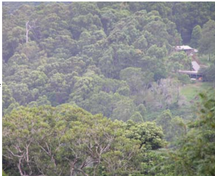
◀ LEFT: MANY HOUSES AT TAMBORINE MOUNTAIN ARE IN A PERI-URBAN ZONE. THE AREA HAS A MIX OF TALL OPEN FORESTS AND SUB-TROPICAL RAINFOREST.