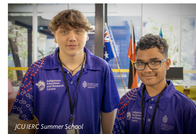
JCU IERC Summer School

jcu.edu.au/ierc/experience-uni/summer-school