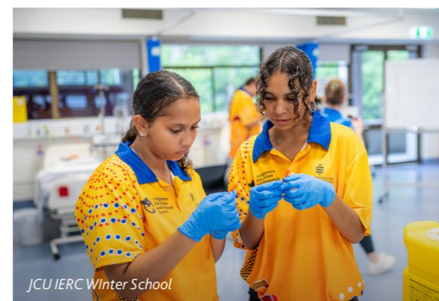
JCU IERC Winter School

jcu.edu.au/ierc/experience-uni/winter-school