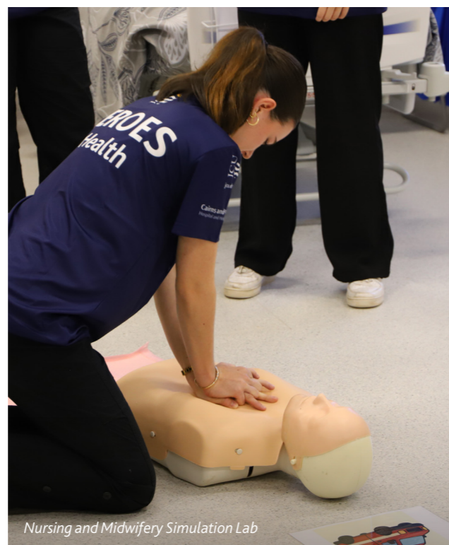
Nursing and Midwifery Simulation Lab

The Nursing and Midwifery Simulation Lab Tours introduces students to Nursing and Midwifery via a tour of JCU's nursing facilities. Students gain hands-on experience of real-world scenarios in the simulation lab where they practise CPR, hand hygiene, monitoring a pregnant mannequin, as well as blood pressure and sugar level testing.