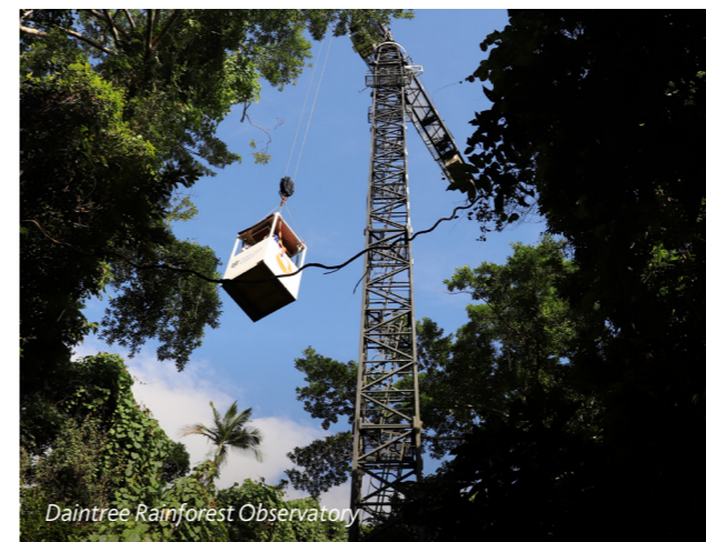
Daintree Rainforest Observatory

For more information: jcu.edu.au/daintree/education