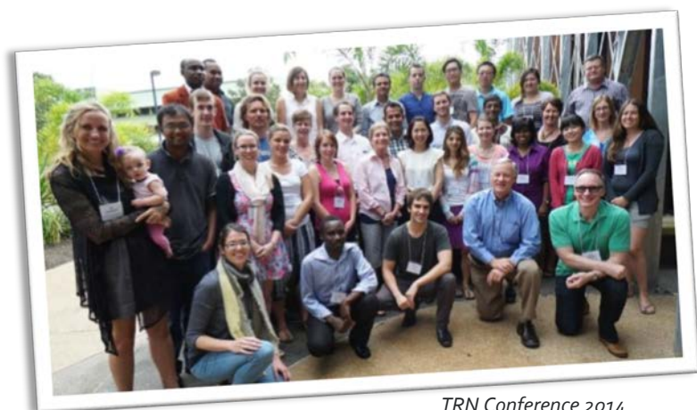
TRN Conference 2014.

Sun protection provided by regulation school uniforms in Australian schools: an opportunity to improve personal sun protection during childhood.