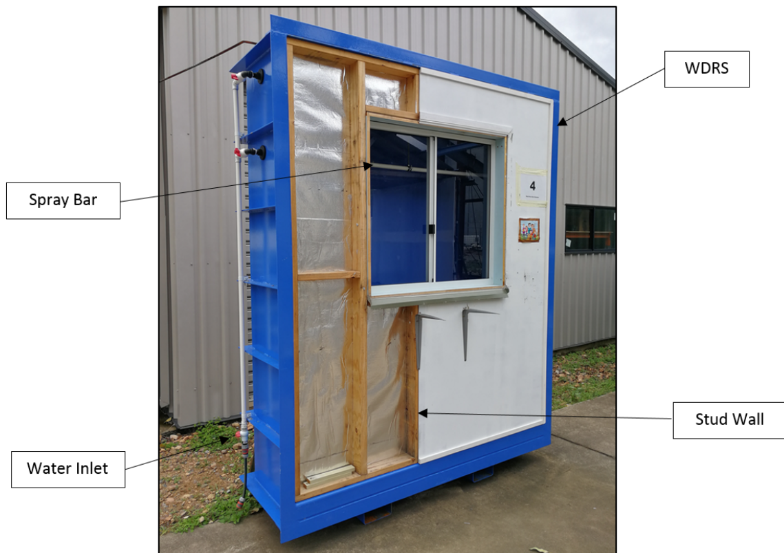
Figure 5: WDRS with Wall and Window Test Sample