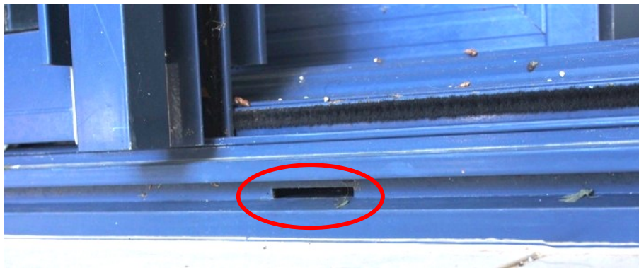
Figure 3 Weephole in glass sliding door frame

Weep holes in windows or glass sliding doors (Figure 3) are designed to allow condensation and minor leakage around seals to pass from the inside to the outside of the building. However, in high winds, differential pressure forces horizontally driven rain on windward walls through weep holes (i.e. in the opposite direction intended in design) and through other gaps in the building envelope.