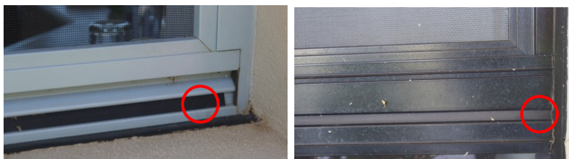
(a) Sliding windows with rubber flaps over weepholes

However some people mentioned, who were in either apartments or houses, they had no water or only a small amount of water enter through their sliding windows during TC Debbie. Typically, the windows without significant water ingress had weep holes that were covered by external rubber strips. Figure 4 (a) shows a window from a house and another in a larger apartment building with rubber seals over the weepholes that performed well. The windows and glass sliding doors in another apartment building, Figure 4 (b), had an external baffle that concealed the weepholes; only a small amount of water leaked through them. This door also had a step that would have assisted in reducing water into the unit from water that pooled on the balcony near the bottom of the door.