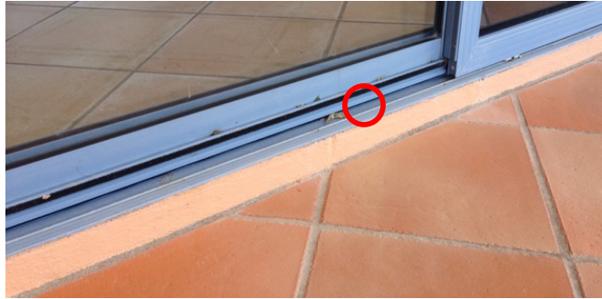
(b) Sliding glass doors with baffle that concealed the weepholes on an apartment balcony