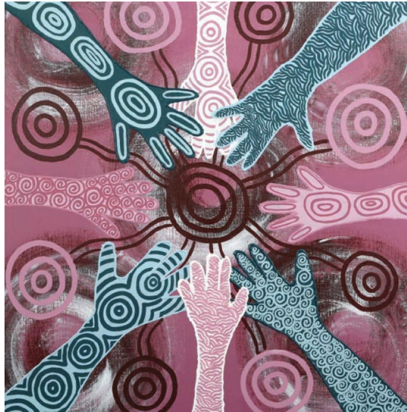
Artwork - Cassandra Savage